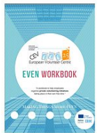
EVEN Workbook: Private Volunteering Initiatives