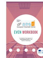
EVEN Workbook: Team Building Events