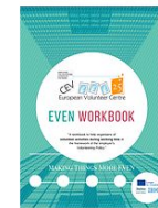
EVEN Workbook: Volunteering activities during working time